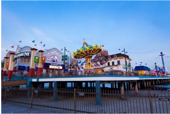
Pleasure Pier, Galveston