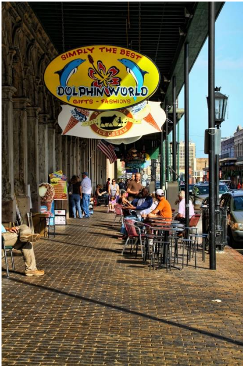
Downtown sidewalk café