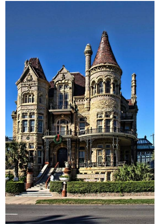
The Bishop Palace