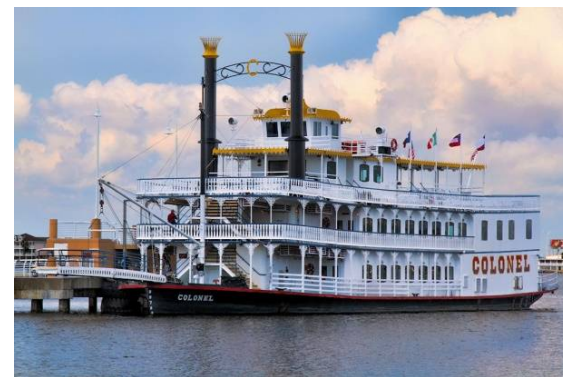
Moody Gardens in Galveston