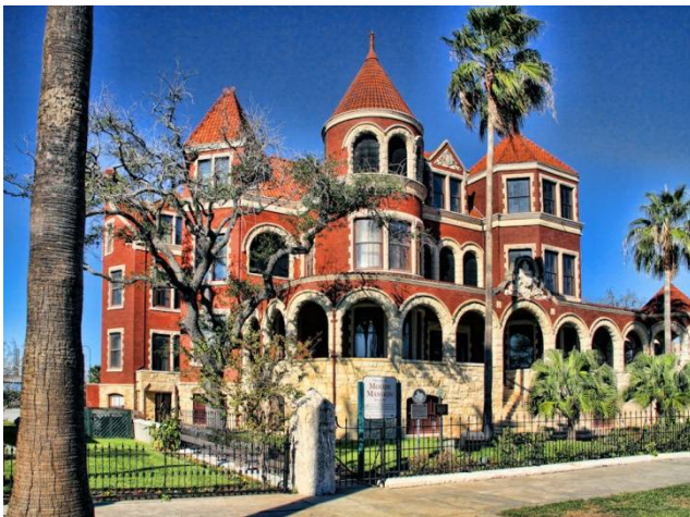
The Moody Mansion