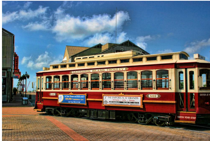
The Trolley to downtown