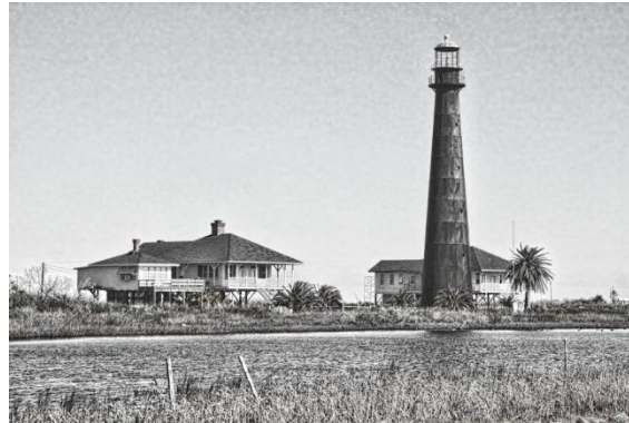
The Bolivar Peninsula, or High Island