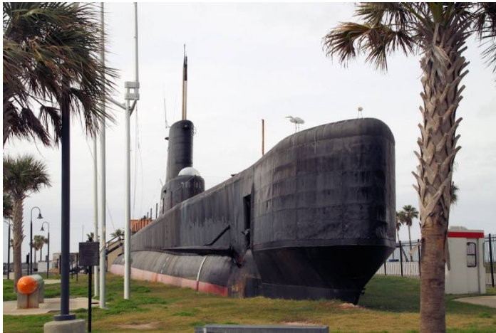
Sea Wolf Park and fishing pier